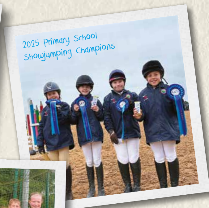
2025 Primary School Showjumping Champions